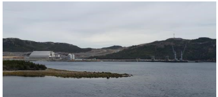
Figure 4: View of the Nickel Processing Plant at Long Harbour

Overall, it was hoped that the presence of the nickel processing facility at Long Harbour would attract services to the region that would, in turn, assist in attracting new residents.