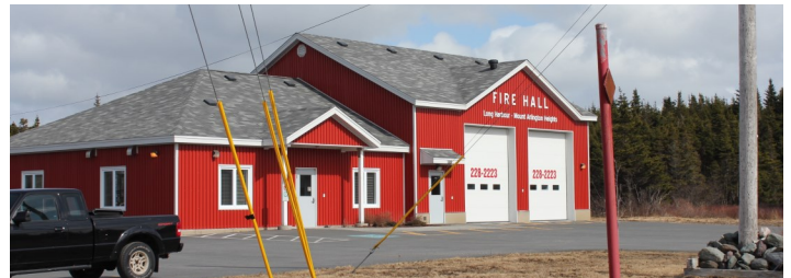
Figure 2: New Fire Hall in Long Harbour, March 2017

The level of traffic increased in the community during construction. Participants noted that the condition of the roads leading to Long Harbour was bad and presented a safety concern. Vale purchased and gifted the Town a new fire hall and fire truck. Key informants suggested that the Town was able to maximize some capital works projects, including a new water treatment plant and improved piping in the community. A new park was developed in cooperation with Vale and the Lodge and Training Centre (now Community Centre) was gifted to the town after the construction phase.