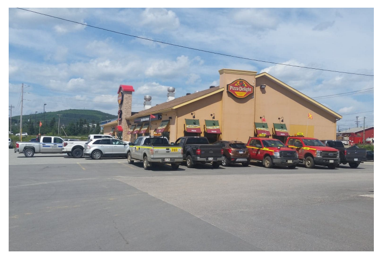
Figure 3: Company vehicles parked outside Pizza Delight at noon in Labrador City, August 2016

Key informants reported that community organizations have struggled to find volunteers due to mobile work. FIFO workers in the community were not thought to be involved in local activities. Job rotations at the mines, Muskrat Falls, and elsewhere, left many workers without time to volunteer. Some community groups had adapted to these challenges by scheduling activities at night, allowing workers to attend. Still, key informants felt that residents were very supportive of community events and activities generally. Residents were very responsive to making donations to causes, for