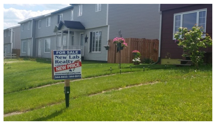
Figure 2: Homes for sale in Labrador City, August 2016

The Wabush Airport was also impacted by the boom. The Airport saw increased congestion due to mobile work during the boom. Traffic decreased significantly following the down-