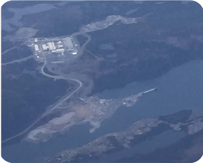
Long Harbour – a “special project” site