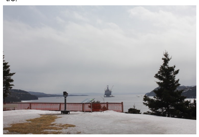
Figure 3: View of Bull Arm from Sunnyside NL.

Sunnyside has developed policies to prevent workers living in trailers. Two RV parks were also developed to address this challenge, allowing the Town to charge water/sewer fees to trailer park operators. One has since closed due to lack of demand. The Town has approached the RCMP about drug-related challenges and traffic signs were being developed to address safety concerns. Sunnyside negotiated to receive recyclable wood from Bull Arm that is sorted and sold to community members as building supplies/firewood for $25 a pick-up truck load. This money, in addition to a grant in lieu of taxes from Hebron, has been put into a legacy fund that they hope will fund a new community building/recreation centre.