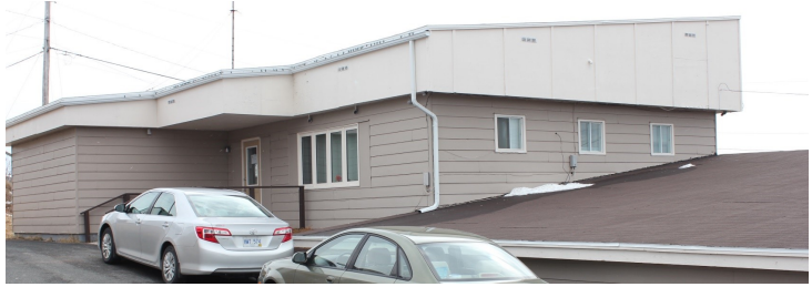
Figure 2: Municipal Building in Sunnyside

A lack of inter-community cooperation in the region was felt to have prevented regional decision-making and cooperation among communities addressing the impacts of resource projects. Though communities did meet to discuss opportunities for regionalization, it was felt that actual sharing of services was not being pursued. Recently, however, communities including Come By Chance, Arnold's Cove, and Southern Harbour have come together to try and establish an Isthmus Regional Development building, to service new businesses, and are willing to work together even though all communities will not be able to contribute equally financially. They feel that they need an industrial partner to fund part of the project but have been unable to secure this funding so far.