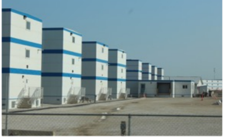
Above: A workers' camp outside of Fort McMurray (December 2014)