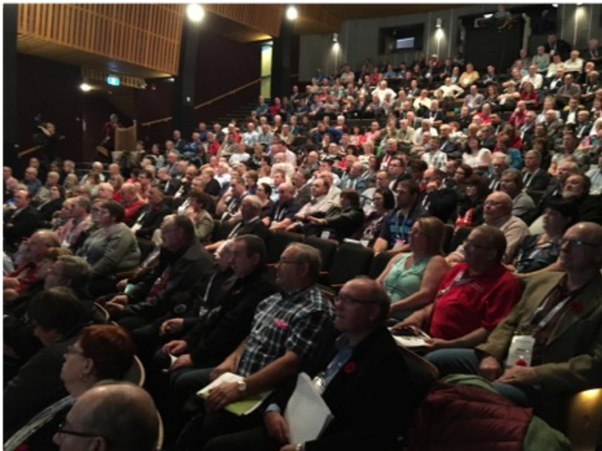
Photo: The final day of the 2015 Convention earlier this month, shot in the Gander Arts and Culture Centre theatre. It was a full house. The delegates are watching the Provincial Leaders' Forum hosted by MNL.