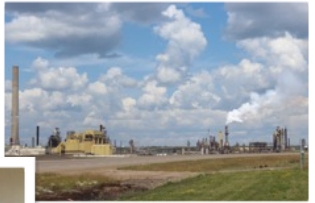
Above: View of an oil sands site from the Highway 63.