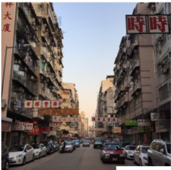
Above: View from the daily commute to work in Hong Kong.