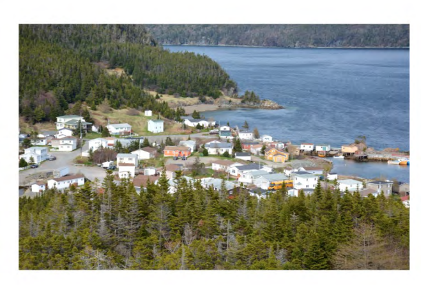
Above: View of Parker's Cove