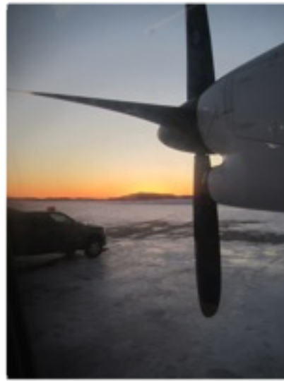
Flying in Labrador (September 2014)